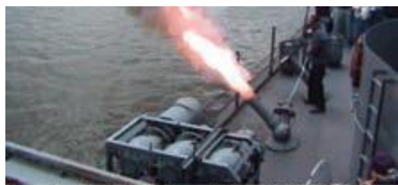
K-gun fired off the starboard side of the USS SLATER DE766

As subs gained underwater speed, depth charges and then k-guns lost favor to “smart” weapons and forward deployed weapons like the ASW torpedo MK-44 and hedge hogs . The “hogs” were only smart because the launch device was connected to the fire control computer allowing some tracking as the ship maneuvered. Gerald Harms, above, was stationed on the starboard hedgehog mount during submarine ops’, in the open directly below the bridge. Harms relates watching a kamikaze fly from dead ahead toward the Frank Knox. As he watched the plane missed the mast of the Frank Knox and sailed into the ship trailing the Frank Knox. Harms and Bob Beachkofski both report the Frank Knox gunners knocking pieces off the incoming kamikaze without causing it to fall into the ocean. A close call to be sure.