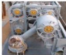
K-gun after restoration