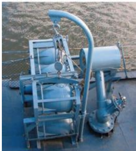
K-gun aboard the USS SLATER DE766