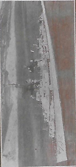
Dedicated by the Frank Knox Reunion Association-2019. Honoring officers and crew who served aboard.

In WWII Frank Knox attacked enemy subs in Atlantic and Pacific waters, credited with sinking one, and survived three torpedo attacks. Admiral Halsey was embarked on Frank Knox for the final attack on Japan. Survived Typhoon Cobra in 1945. Very active during the Korean War including the evacuation of Tachen Islands. First surface unit to spot Project Mercury capsule in 1963. After grounding and surviving 38 days on Pratae Reef in 1965 was repaired and sailed again. Frank Knox was recognized as the most improved ship in 1968 and awarded the Arleigh Burke Fleet Trophy. Very active from 1969-70 in Vietnam Service.