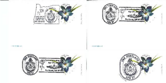
4 USPS Commemorative Postcards – Date stamped (USS Portland)