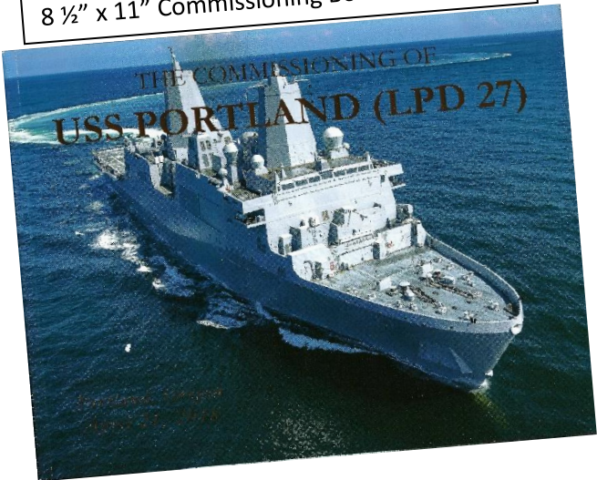
8 1/2" x 11" Commissioning Book – soft cover