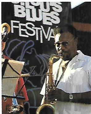
Blues Heritage Festival