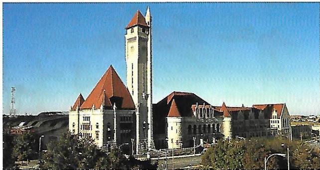
St. Louis Union Station