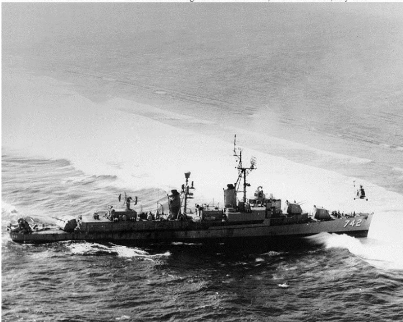
Photo # USN 1113134 USS Frank Knox aground on Pratas Reef, South China Sea, July 1965

This photo shows our ship upon Pratas Reef 50 years ago. The ship ran aground July 18, 1965. According to Lionel Price author of the new book, Knox Maru and on the bridge at the time of the accident as JOD, the ship sat atop the reef for 38 days while the crew along with those of the salvage operation met the challenges of 2 typhoons as well as handling dangerous fuel and ammunition off-loads. Price writes, "just about every day there were dangerous occurrences." Barring the unforeseen, Lionel Price's book is expected to be published later in 2015.